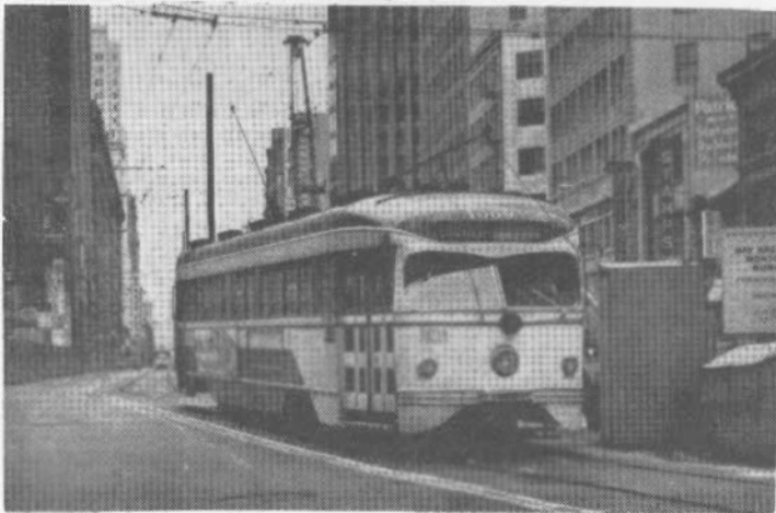
San Francisco Municipal Railway Car 1009 on Market Street September 6, 1969.

The closest system to San Diego is the San Francisco Municipal Railway. This system is the largest of the four systems to be covered in this article. It has five streetcar lines in operation utilizing street running, two subways and a private right-of-way. All of the lines (J,K,L,M & N) run on Market Street in downtown San Francisco. Eventually the lines will be running in a subway beneath Market, when the Bay Area Rapid Transit project is completed in the early 1970's. Also the present PCC type streetcars are scheduled to be replaced with a more modern type in the early part of this decade. Not to be forgotten in the San Francisco are the three cable car lines and many trolley-bus lines. For almost a $20 bill, you can fly round-trip to San Francisco or if you have more time take the "San Diegan" and SP "Davitlight".